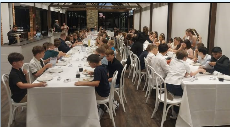
Year 6 Graduation Dinner