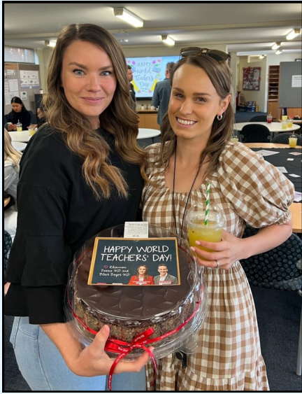
World Teachers' Day