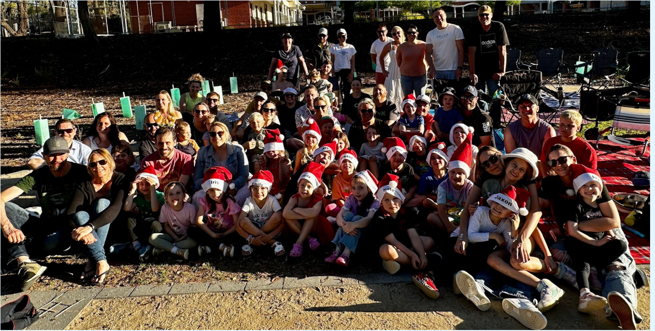
HB 9, 10 & 13 End of Year School Picnic