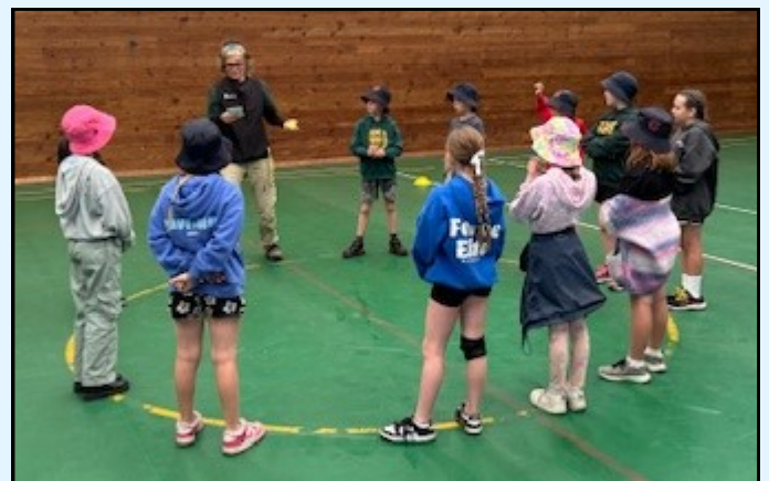
Wirraway and Arbury Park Camps