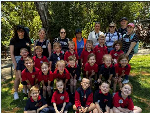
Gorge Wildlife Park Excursion