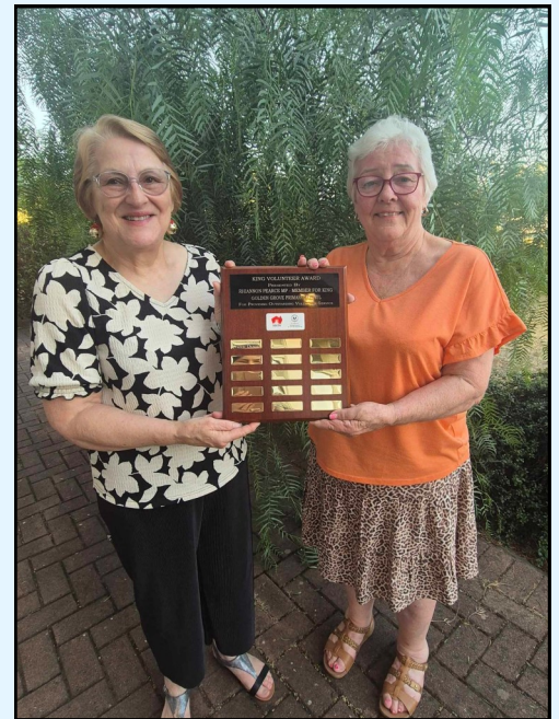
Volunteer of the Year Awards