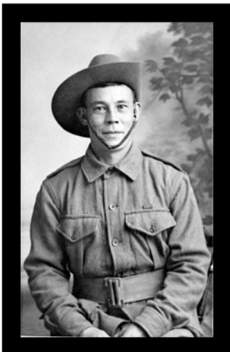
Private William Edward (Billy) Sing DCM, 31st Battalion

Below are some examples of what we are looking for.