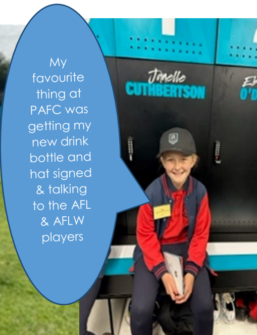
My favourite thing at PAFC was getting my new drink bottle and hat signed & talking to the AFL & AFLW players