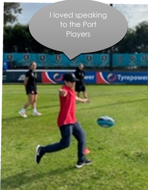
I loved speaking to the Port Players