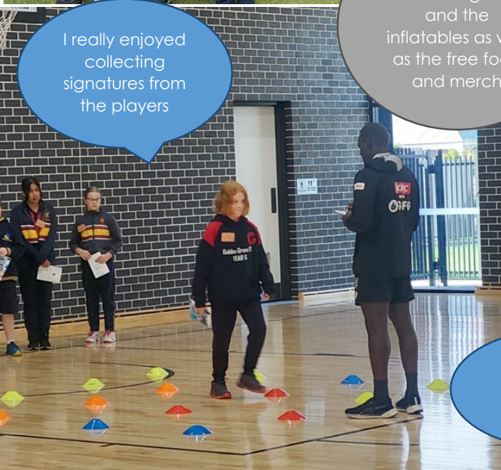
I really enjoyed collecting signatures from the players