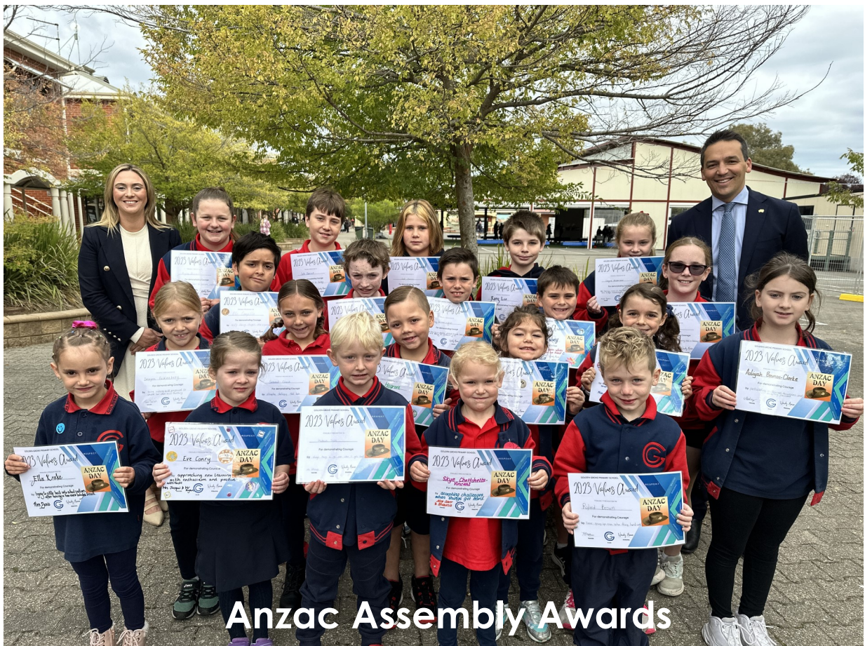
Anzac Assembly Awards